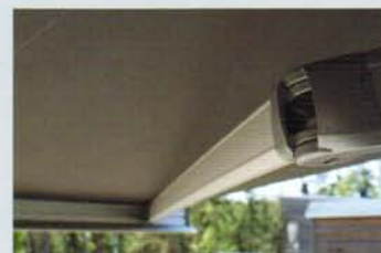
Heavy duty folding arms with Dyneema® connections

The decoration kit, which includes covers for the end caps and strip for the front profile are available in three colours: silver, white and graphite. The awning is available in silver or white.