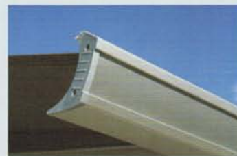
Front profile with decoration strip